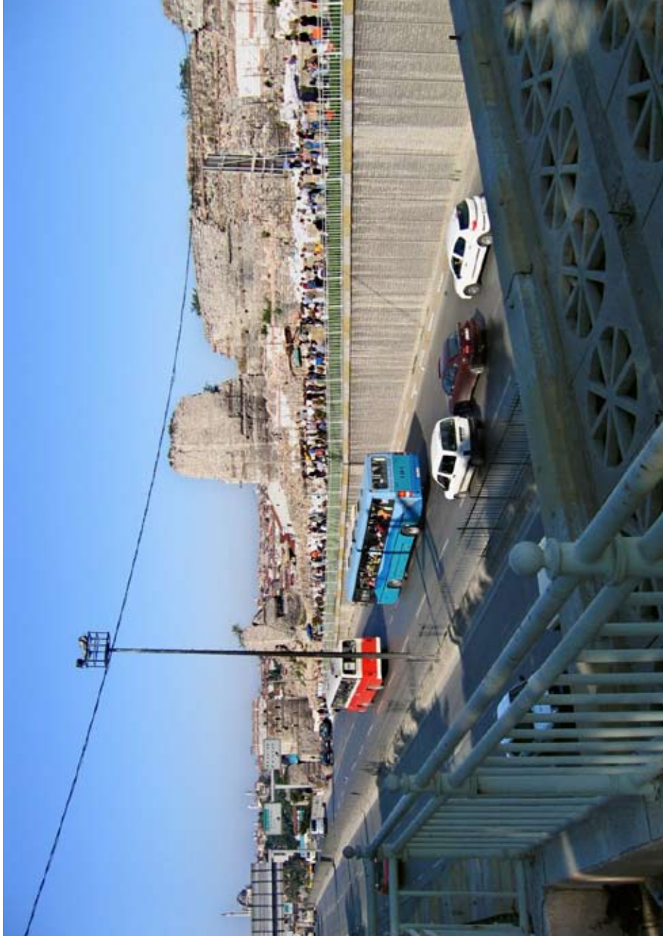
Informal market along the Byzantine city walls and Londra Asfaltı, an arterial road to the west, Istanbul, 2005