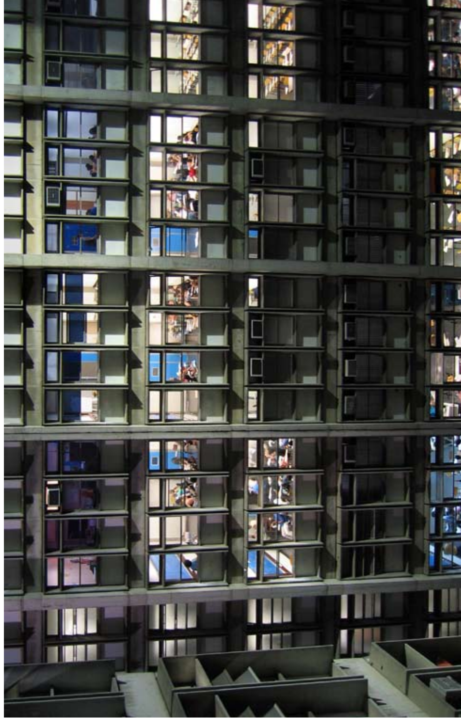
Universidade do Estado do Rio de Janeiro (UERJ), 2005